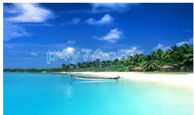
Fig. 2 An example of TransparentCAPTCHA